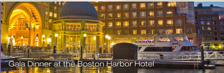
Gala Dinner at the Boston Harbor Hotel