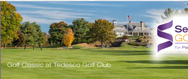
Golf Classic at Tedesco Golf Club

JOIN US for a Triple Play in the fight against Pancreatic Cancer August 27 – 29, 2016