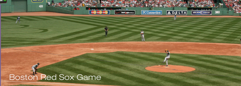
Boston Red Sox Game