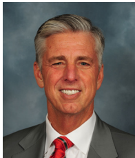
David Dombrowski President of Baseball Operations, Boston Red Sox